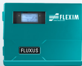
FLUXUS® G721 ST

More than 25 years of experience in non-invasive ultrasonic flow measurement