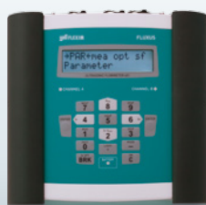
FLUXUS® G601 ST