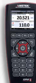
ASC300 ASC301 ASC321 ASC-400 ASC-400 BARO