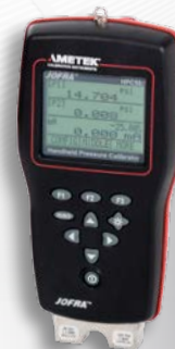
HPC500 HPC502 HPC600

When combined with these JOFRA calibrators, the APM is a powerful calibration tool.